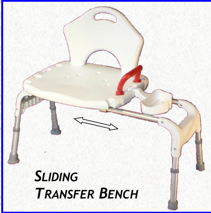
SLIDING TRANSFER BENCH